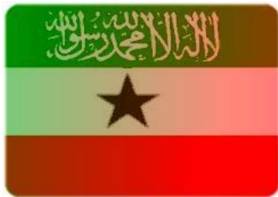
The flag of my country.

In My country is Somaliland not Somalia. They separated in 1991 and the former British Somaliland is an unrecognized country and people are tired because they have been fighting in the past 20 years. Now they have peace and the government always asks UN, US, EU, AU, and many more, to recognize them. That is the only thing they need. I hope my country is going to get recognition soon.