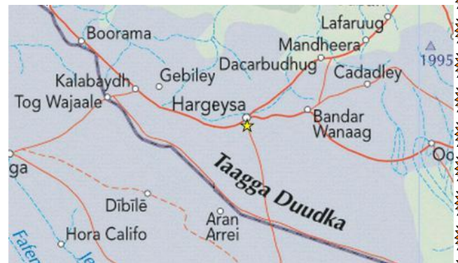
The map of my town.